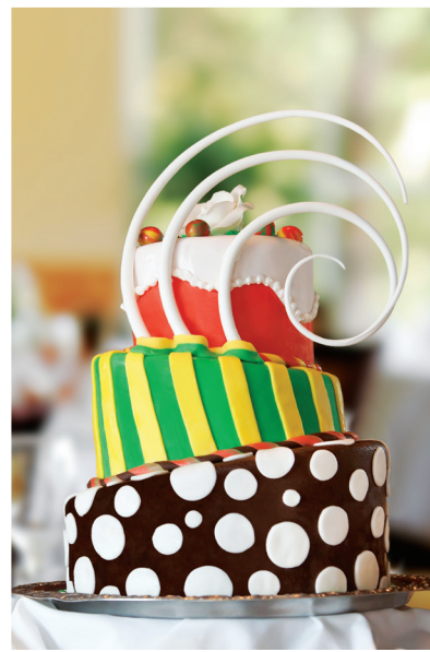
TROPICAL ELEGANCE $9.75 (51-100 guests)