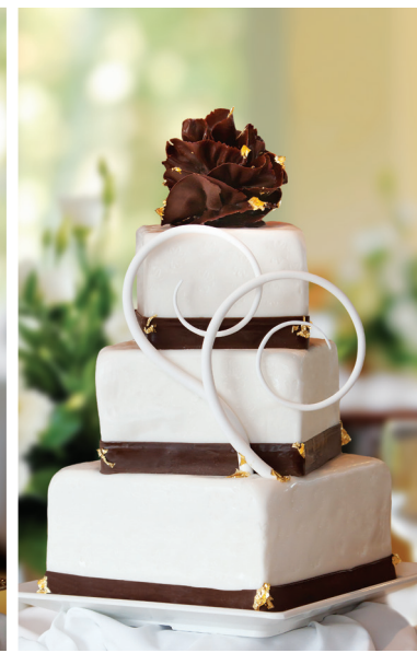
SIMPLE & SWEET $10 (101-150 guests)

There are no substitutions unless there is an allergy or special dietary reason.