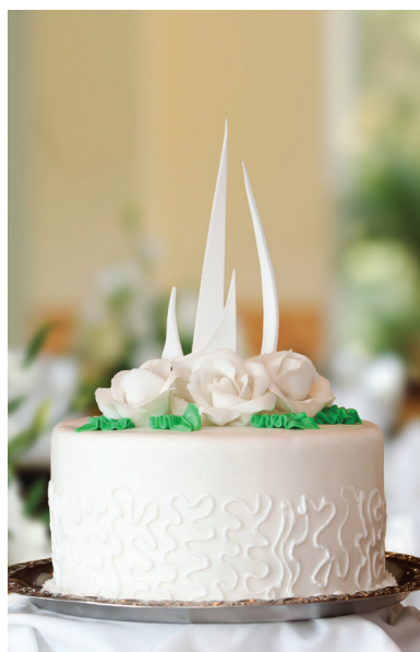
SHIMMERING ROYALTY $7 (up to 25 guests)

Vanilla, Chocolate, Mocha, Coffee, Caramel, Pistachio, Strawberry, Raspberry, Blueberry, Orange, Lemon, Pineapple.