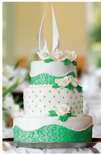
BRIDAL BLISS $9.75 (51-100 guests)