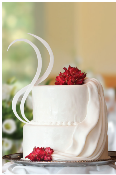
ENCHANTING PEARL $9 (26-50 guests)